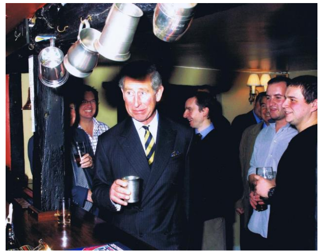
It wasn't exactly to his taste . . .