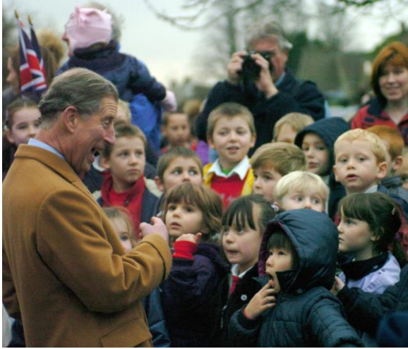
Swaffham Prior schoolchildren came to meet their future king